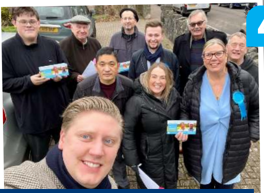
Thank you also to everyone who has volunteered to help us

As we promised at the last election, we've recruited an extra 20,000 police, including 724 here in Merseyside. An extra £18 billion is being spent on tackling crime.