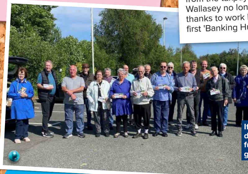
If you can lend a hand during this campaign or in future, you'll be part of a growing team...

Since 2010, the number of businesses in Wirral has risen from 6,760 to 8,770, creating new jobs and apprenticeships. Now that inflation is falling, we will reduce taxes on business and jobs, and make it easier to get back into work.