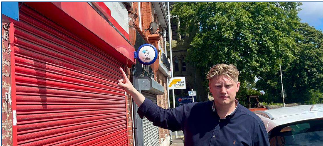
Upton Post Office, on Ford Road, is one of two branches which Post Office bosses have said will not re-open - Robbie and the Conservatives will keep pushing for Upton and Wallasey Village, to re-open.