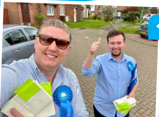
Thank you to everyone who we've spoken to so far in this election campaign

1 The economy is getting stronger as we deal with the effects of the pandemic and Ukraine.